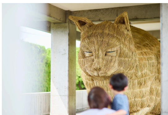
Matsumoto Yuma, Skynecco [Skynet made of Meow] , 2025, Rice straw on bamboo, wood