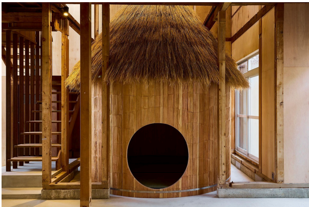
Sagara Ikuya & Nakagawa Shuji, The Wooden Bucket and Thatched Roof Teahouse , 2025. Cedar, rice straw

An international Art Festival Featuring Expressions by Contemporary Artists, Craftspeople, and Artisans